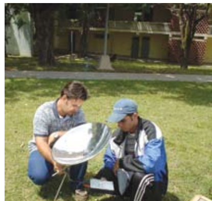
Energy education is part of the curriculum at teachers' colleges.