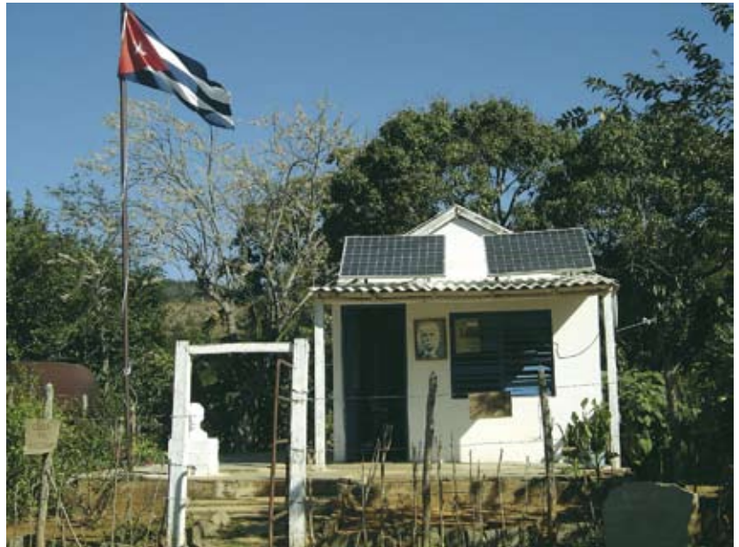
A school electrified with solar panels in San Narciso, Cienfuegos, is an educational opportunity for the entire community.

Energy education is not a new topic in Cuba. During the 1970s, children from primary and secondary schools were organized in neighborhood "Click Patrols." They went door to door to ask that families turn off unused electric appliances.